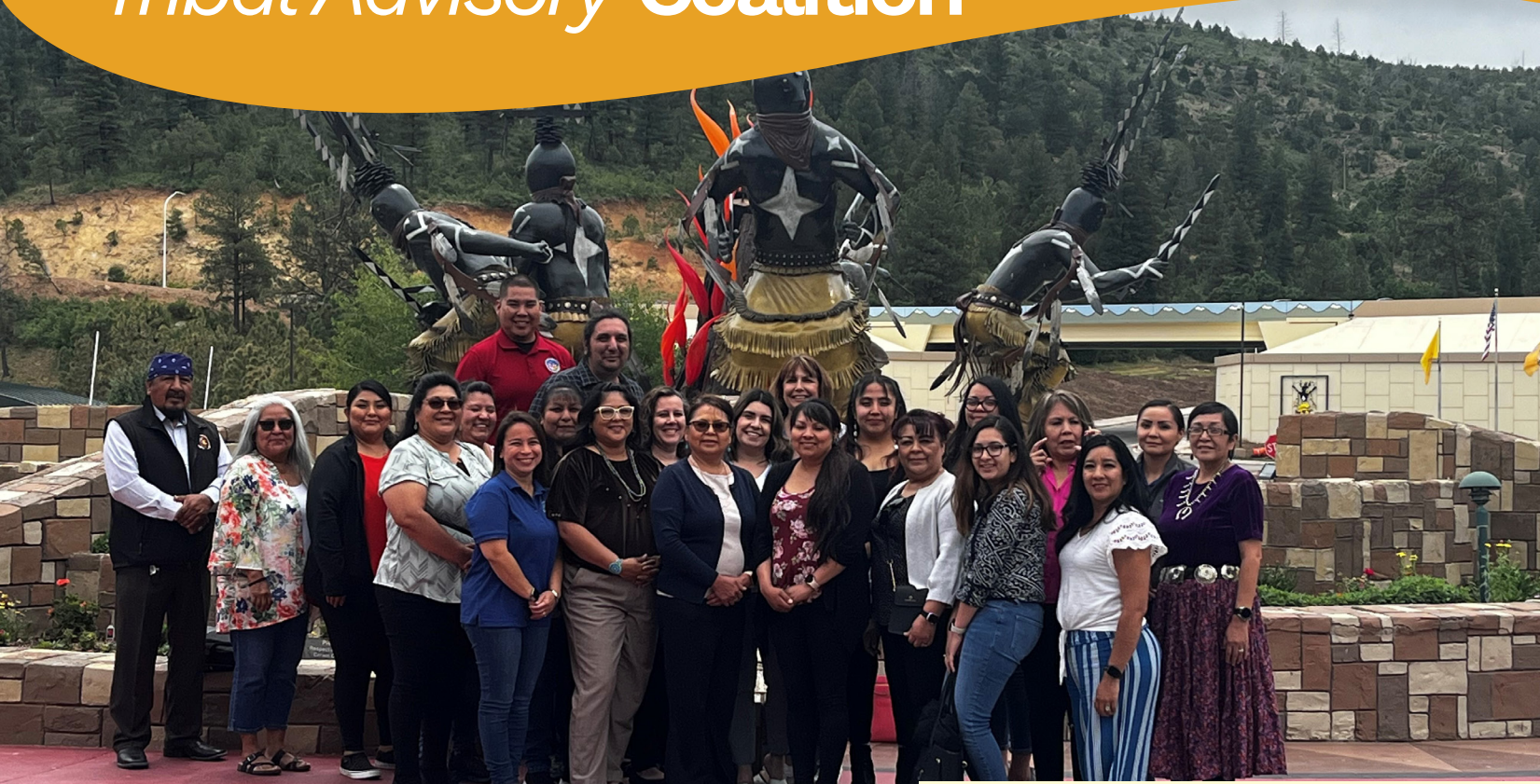
Tribal Advisory Coalition (TAC) at the Inn of the Mountain Gods, Mescalero Apache Reservation..